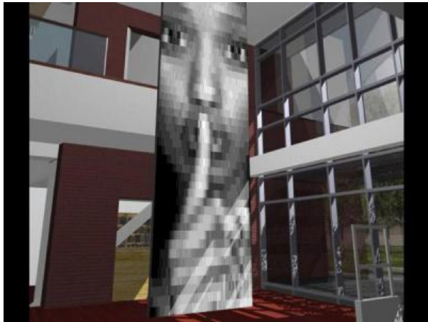
Portrait in 12 Volumes of Grey," by artist Christian Moeller, proposed for the new Walnut Creek Public Library. (Courtesy City of Walnut Creek/Christian Moeller)